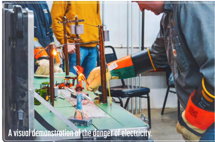
A visual demonstration of the danger of electricity.