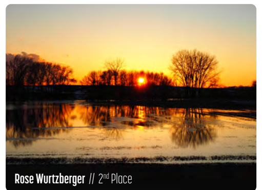
Rose Wurtzberger // 2 nd Place

Thank you to everyone who submitted photos. Based on the strong response, our 2027 calendar will feature selected images from this year's entries.