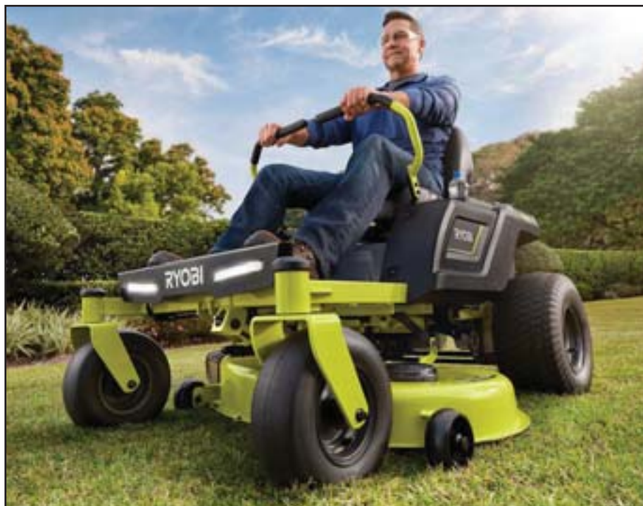
Electric mowers, like the RYOBI 48V Zero Turn Electric Riding Mower, are becoming more popular and practical alternatives to gas-powered mowers. Other electric lawn care product makers include Stihl, Ego and more.

much quieter and easier to use. Most batteries last about 30 to 45 minutes. If you have a lot of space to trim, you may want to consider a back-up battery or plan to work in short bursts. If you're interested in purchasing an electric trimmer, the main factors to consider are the battery's life, charge time and power. Costs can vary depending on your needs, but you can find a quality version for about $100.